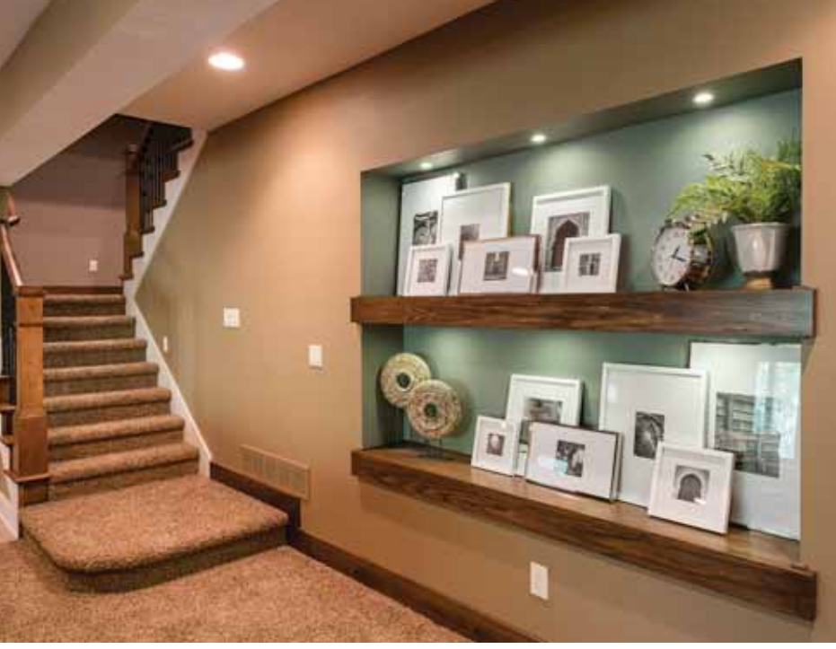
Opposite, top: The lower level family room works for movie night and slumber parties. • Left: The bar area is great for serving treats and snacks. • This page, clockwise from top left: Two sisters are close to each other, but with separate rooms. • Shelving space in the family room is good for displaying photos. • A secret space is fun for hiding and playing.

44 | WelcomeHome DES MOINES WelcomeHomeDesMoines.com WelcomeHomeDesMoines.com February/March 2014 | 45