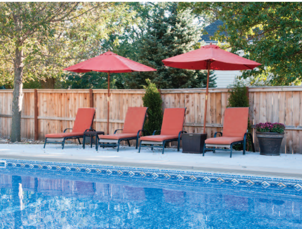
Left: Market umbrellas and chaises encourage relaxing on the deck of the new pool. Below: Deck seating and dining, in addition to room in a covered patio, allows for large-scale entertaining.

Julie and Bart Baudler of Clive wanted to expand their living space. With four active kids, the family loves to invite in friends for casual entertaining. It's fun to tailgate before a game, enjoy appetizers before a school event, or gather the neighbors for an impromptu get-together. The original plan was a no-brainer. The Baudlers own 13 acres out near Adel, and they had planned to build a new home, add a barn, and raise a few horses for everyone to enjoy.